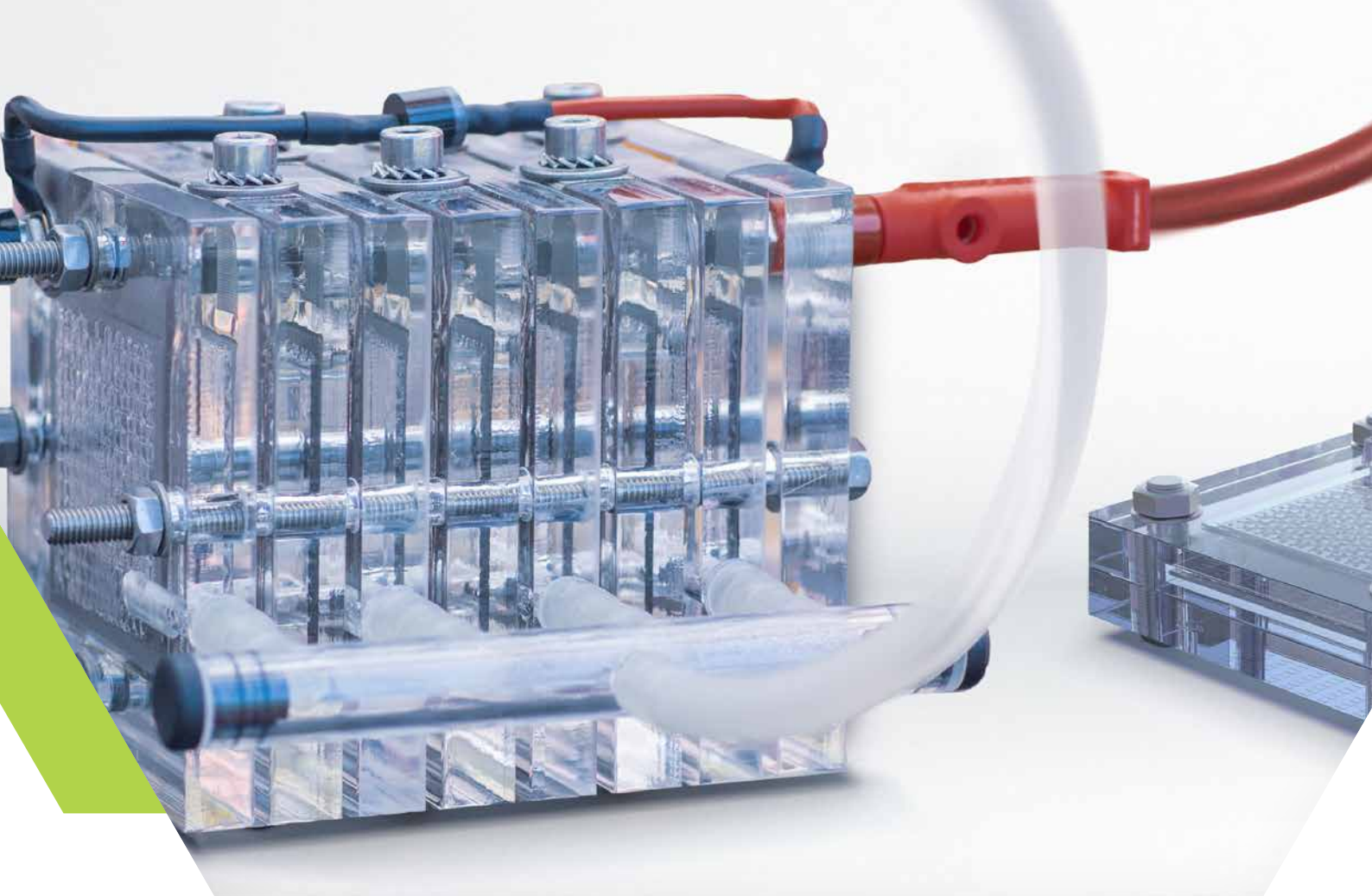
Test setup of a fuel cell on a small laboratory scale, as commonly used for research purposes.

In addition, in some fuel cell variants the gasket material must withstand temperatures exceeding 500 °C. A purely elastomer-based material cannot be used here; the gasket material must be designed for high temperatures in such applications. The service life of the materials must also be long to ensure the fuel cell requires little maintenance and remains operational.